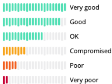
Figure 3. The nightly recharge status has six different statuses that are formed by combining information on the ANS charge and the sleep charge.

situation when (s)he has been better for a couple of weeks.