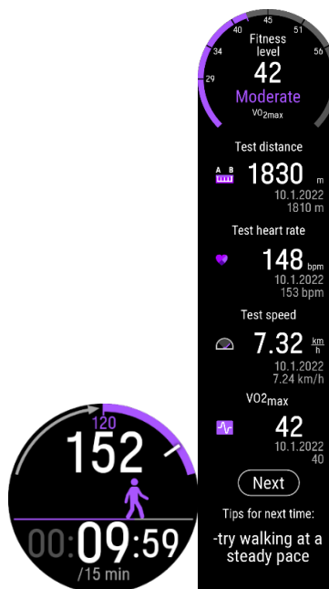
Fig.1. Illustration of real-time guidance (heart rate, time walked) for Walking test in Polar wrist unit (left) and result view (right).

Once the test is completed, the resulting VO_{2max} result is calculated by factoring in the walked distance in 15-minute test phase, the heart rate during the test (average heart rate of the last five minutes), and personal characteristics (age, gender, height and weight). The result is expressed in ml/kg/min, which is the standard expression of maximal oxygen uptake ( VO_{2max} ). Additionally, the watch may display tips on how to perform the test better next time (Fig. 1). For example, if the pace or cadence varied, or if the user ran, a message will suggest to walk steadily next time. If the heart rate was lower than guided, a message will suggest to walk faster next time.