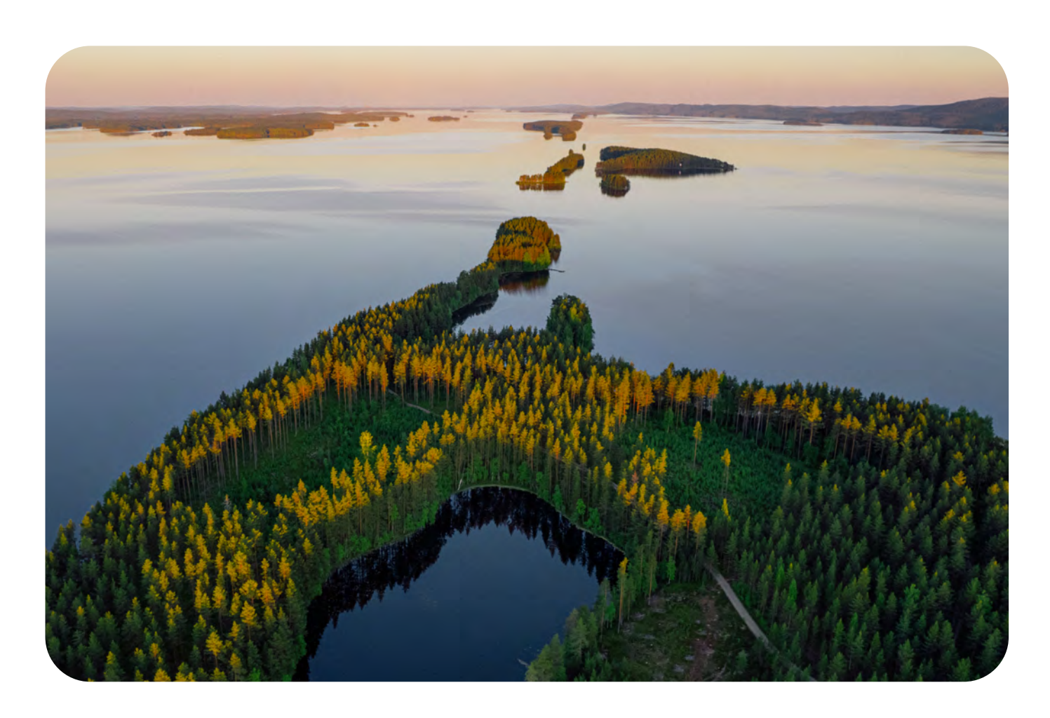
First version approved by Polar on December 21, 2022